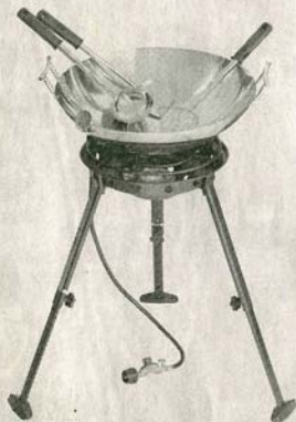
Weber-Stephen Charcoal Grills offers a wok attachment for its kettle grills.