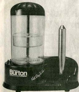
Hot Dog to Go by Max Burton cooks six frankfurters and two rolls at once.