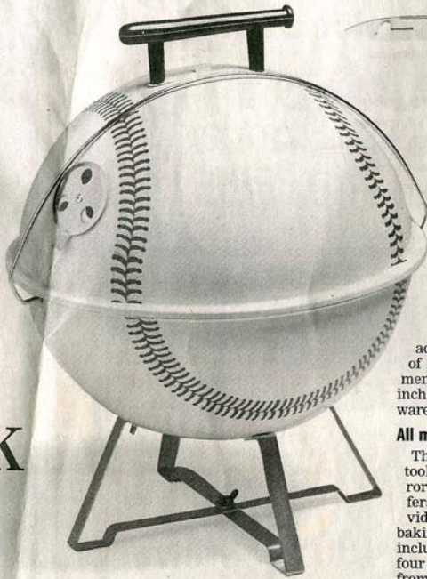
The baseball-shaped grill by Charcoal Companion should get the party going.